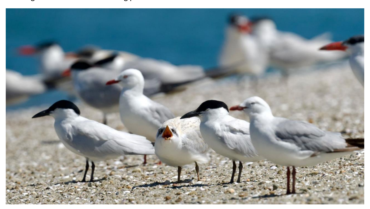
Gull-billed Terns with juvenile - photo by Steve Wood, late December 2024 (info and photo from Birds Nelson Facebook page)

"A pair of Australian [Gull-billed] Terns have successfully fledged two young in Waimea Inlet, Tasman District. The first attempt in mid-October failed when the egg was lost (apparently washed out). The birds (presumably the same pair) laid again in late October/early November, and very young chicks were present on 28 November. Three chicks were seen, but one was found dead on 22 December with a puncture wound to the breast - possibly from an attack by a Caspian Tern[?]. The remaining two chicks were seen flying on 26 December. Both young were seen on 30 December but none were present on 1 January 2025. Young terns usually remain dependent on adults for food for a prolonged period of time so keep a lookout for the family. Interestingly, a third "adult" was present periodically throughout the nesting period - early on it had only a partial black cap and appeared to be an immature, but later was indistinguishable from the breeding pair."