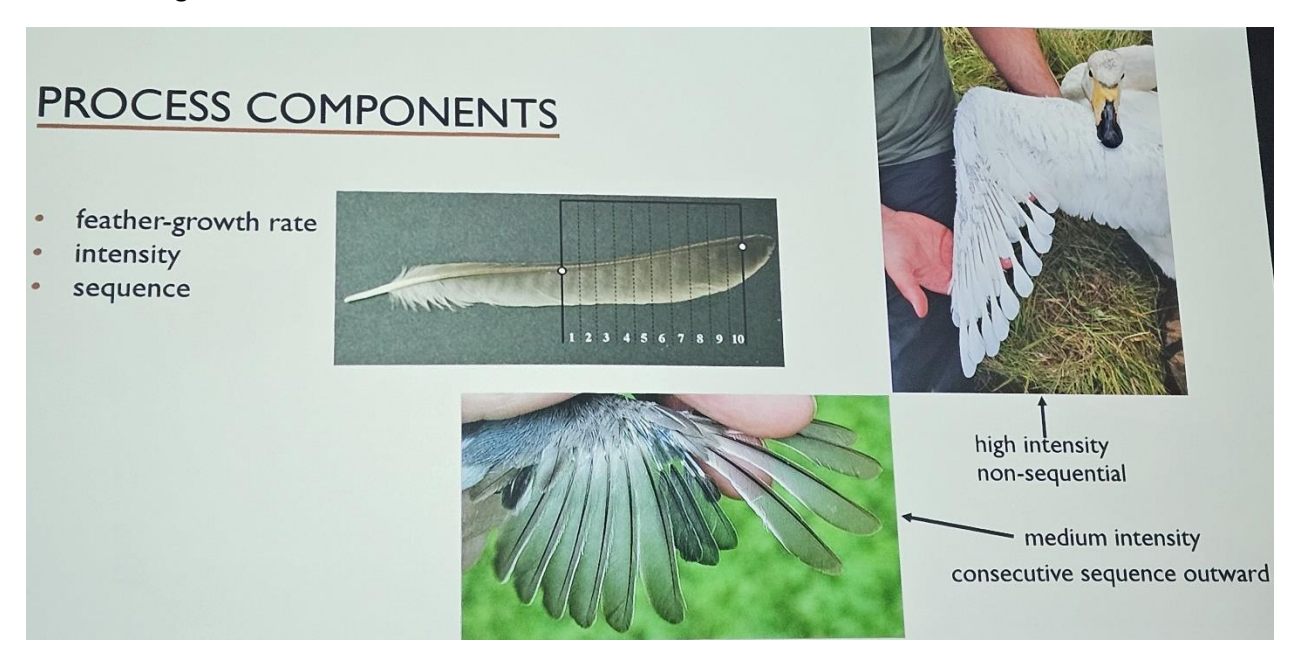
Fun fact 3. Longer feathers grow faster. Growth rate and size scale allometrically.

There are different patterns of moult. Some birds like penguins and the swan pictured below have a catastrophic moult and replace all their feathers in one go. While this is happening they can't fly or swim. Other birds, such as passerines, lose a few feathers at a time so they can carry on with life as usual. For primary feathers on a wing, moult starts from the innermost primary feather and continues to the outer edge.