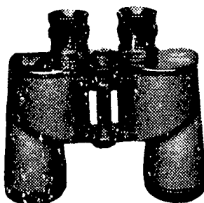
The model illustrated above is 7 x 35 C.F. — Price £27

We have traded in optical and scientific equipment for 70 years and recommend Prominar as the finest binoculars we have ever examined. Prices are very reasonable: £27 for 7 x 35; £34/10/- for 7 x 50. The following features make Prominar particularly suitable for Birdwatchers: