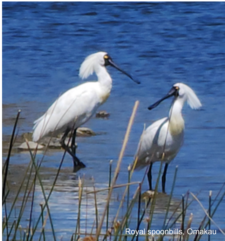
Royal spoonbills, Omakau

Over the summer, I've been travelling to and from Dunedin more than usual and enjoyed taking a moment to do some birding. The Karitane estuary was beautiful with bar-tailed godwits, pied stilts, variable and South Island pied oystercatchers and kingfishers calling in the distance. Inland at a constructed irrigation reservoir on farmland near Blackstone Hill, I saw two Royal Spoonbills! Very unexpected.