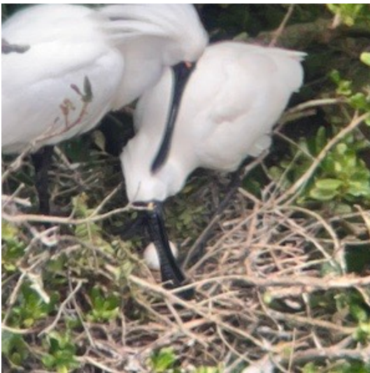
Nugget Point Spoonbills. Late October, 10 pairs, many less than 2 years ago

Karitane: nesting oyster catcher, October