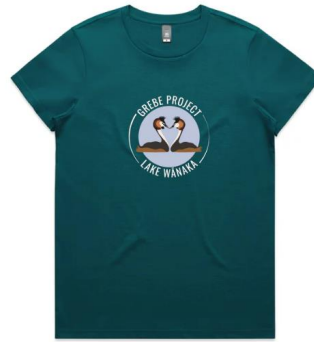
Grebe Project | Womens Tee | Pre-order From $43.00