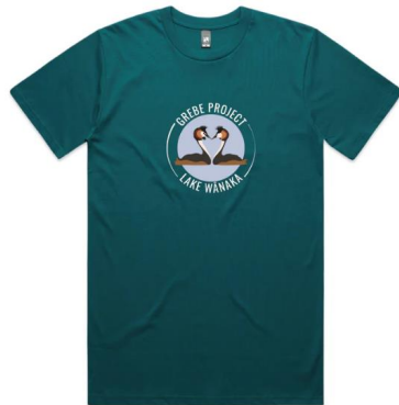
Grebe Project | Mens Tee | Pre-order From $43.00